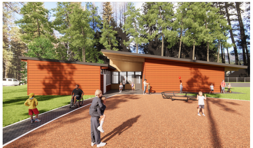
Rendering shows west side image of the new BBS

Things that are included in the design are way more safety features, and maybe one or two new classrooms. We also have all the walls that will be replaced, the roof and even the floors. Because currently the floors in the school contain asbestos which have some cancer causing chemicals in them. When the floors are replaced the carpet will be firm and easy to clean, you know the classic school carpet. One cool thing about the design is the students can make suggestions, like what color the walls are and the carpet. All of the students are aware of the new building and are very excited to see how it turns out. The head teacher Delaney Sharp has meetings with architects often to set the foundation of the plan for the building. Some artists have drawn what they think the school will look like and they are spectacular. I can't wait for the awesome new Black Butte School. And can't wait for the community to see it as well.