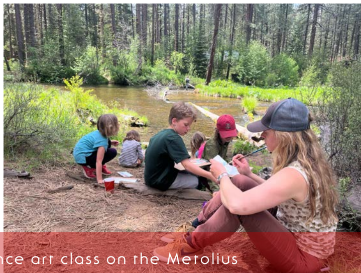
Lower grade students experience art class on the Merolius