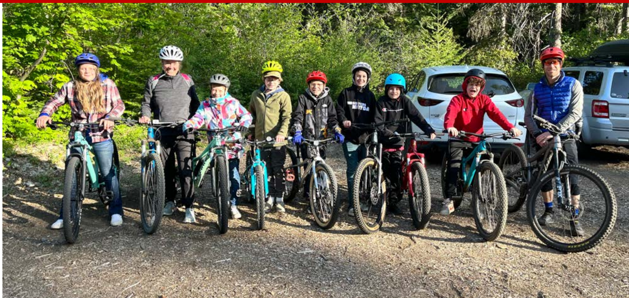
Upper grade students recently rode their bikes from Suttle Lake to BBS on Bike to School Day

Welcome to the new format of the BBS Quarterly Newsletter! Find news and updates from Black Butte School, student journalism articles, recent photos, and more.