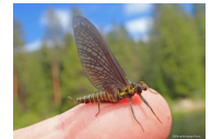
Metolius Green Drake