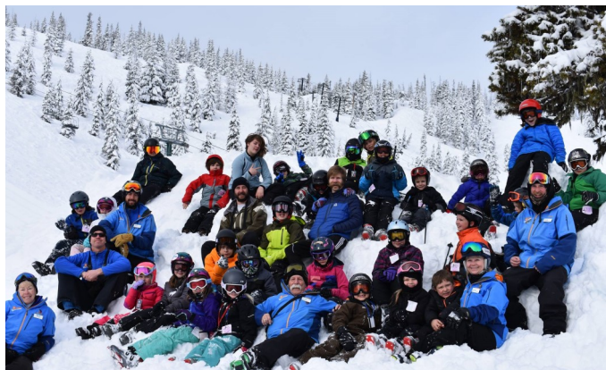
Black Butte School students, staff, and 2017 Hoodoo ski instructors celebrating a great ski season!

All skiers learn skills that help them improve. This year there were nine first time skiers at school. They improved a lot during the season. They learned to ride ski lifts by themselves and now are working on turning and control. They started on the bunny hill and now do many runs off Manzanita. This is my ninth ski season with Black Butte School and I've learned something new each year. I am proud of my skiing ability and am thankful for all we learn in the ski program.